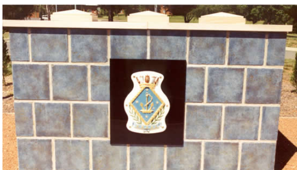
Title: AWE0566ga.jpg Type: Image Date: 3 May, 2023