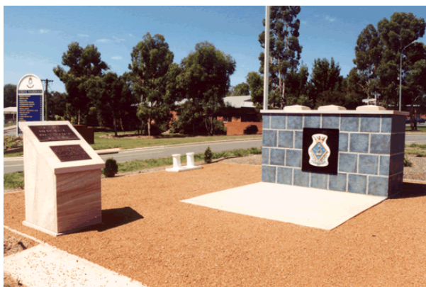
Title: WRANS Memorial HMAS Harman Type: Image Date: 3 May, 2023