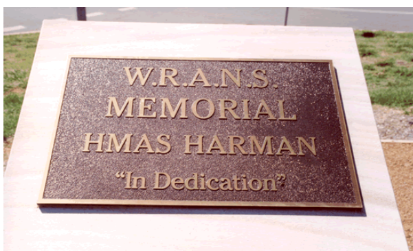
Title: AWE0566gc.gif Type: Image Date: 3 May, 2023