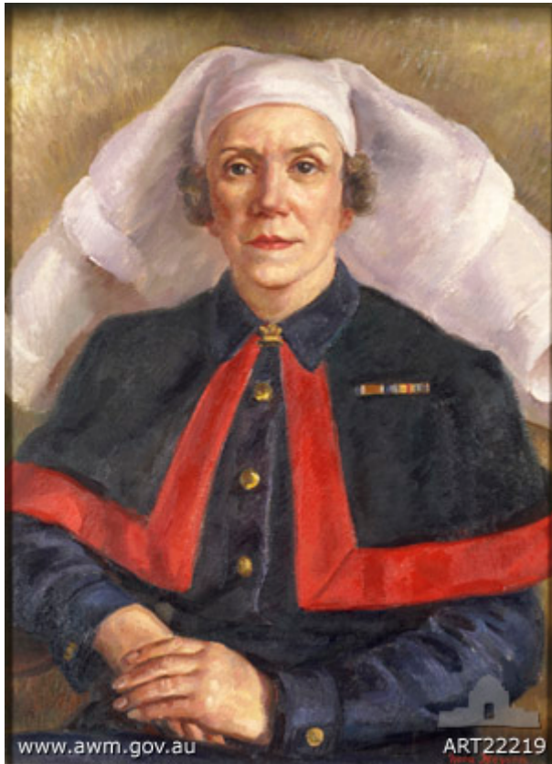
Title: 176103.tif Type: Image Date: 3 May, 2023