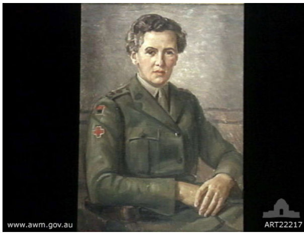
Title: AWE0413ga.jpg Type: Image Date: 3 May, 2023