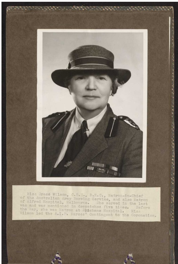
Title: ANF.UDS2012382-1_Page_31.jpg Type: Image Date: 3 May, 2023